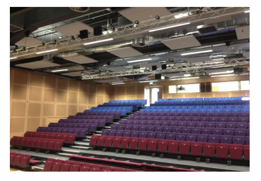
Nano Perforated Acoustic Panels

Also available in the DYNAMIK walling range: