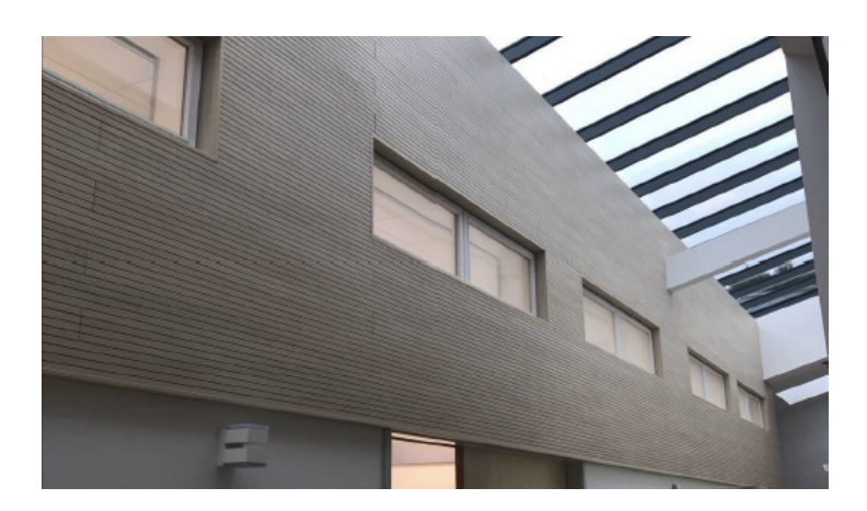
D-PET Acoustic Panels

Product specifications may be subject to change without notice, please contact DYNAMIK for the latest product information