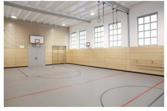
Micro Perforated Acoustic Panels