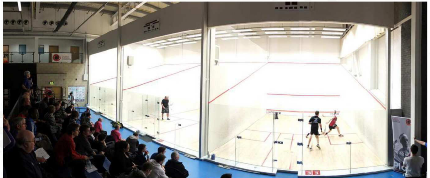
Free view for spectators through a glass back wall

All glass panes are static proven, manufactured by a horizontal process, approved and certified by the World Squash Federation. The glass panels are in accordance with ESG-H DIN 1249/EN 12150 and can be heat soak-tested at extra charge. The surface compressive areas of the tempered glass shall be demonstrated by differential stress refract meter measurements to be controlled at manufacture at 100 N/sqmm.