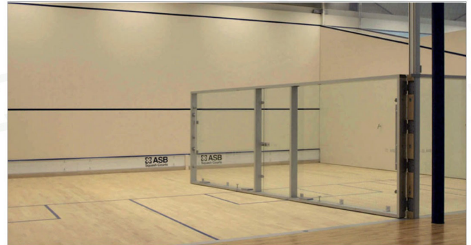
Open area after ASB PRO Glass Back Wall rotating

ASB RotaryGlassBackWall enables the back wall to rotate inwards. It is the same construction like the ASB ProGlassBackWall, extended with the necessary sub-construction, fixing and hanging system, which enables a rotation at the angle of either 90° or 180°.